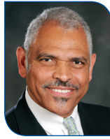
Arnold W. Donald President and CEO Carnival Corporation and PLC Chair, BJC Community Benefit Committee